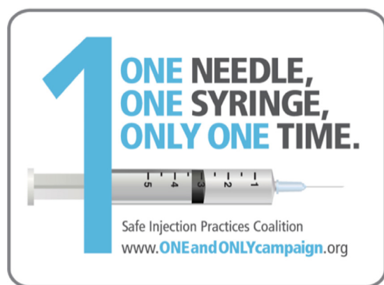
Fig. 2 – Advertising campaign image “One and Only Campaign”.