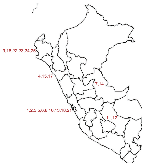
Fig. 1 – Locations of the hospitals that participated in the study. Guillermo Almenara Irigoyen National Hospital, 1 Edgardo Rebagliati Martins National Hospital, 2 Ate-Vitarte Emergencies Hospital, 3 Belén de Trujillo Hospital, 4 Daniel Alcides Carrion National Hospital, 5 Sergio E. Bernales Hospital (Collique), 6 Level II Pucallpa-Essalud Hospital, 7 Dos de Mayo National Hospital, 8 Santa Rosa-Piura Level I Support Hospital, 9 Hipólito Unanue National Hospital, 10 Adolfo Guevara Velasco-Essalud National Hospital, Cusco, 11 Cusco Regional Hospital, 12 Madre Niño San Bartolome National Teaching Hospital, 13 Yarinacocha Amazon Hospital, 14 Trujillo Regional Teaching Hospital, 15 José Cayetano Heredia-Regional Hospital, Piura, 16 Víctor Lazarte Echegaray National Hospital, Trujillo, 17 Arzobispo Loayza National Hospital, 18 Central Police Hospital, 19 Hospital Regional Lambayeque-Chiclayo Regional Hospital, 20 Alberto Sabogal Sologuren National Hospital, 21 HAMO, 22 HEJCU, 23 Coronel Luis Arias Schreiber Central Military Hospital, 24 Sullana Level II Support Hospital. 25

All the interviewers were instructed on the correct administration of the questionnaire and were given the response sheets for common questions to the interviewees. After the surveys were given, the data were entered in an Excel database