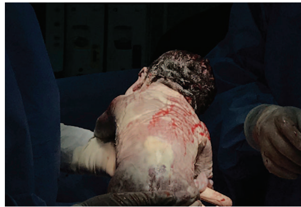
Figure 3. Newborn with fully healed spine.

2-g intravenous and the patient was then extubated following reversal with neostigmine and atropine, with full recovery from total neuromuscular blockade.