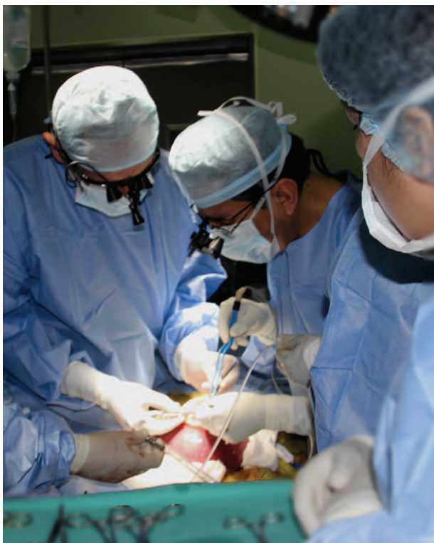
Figure 2. Adequate uterine relaxation that allows neurorrhaphy.