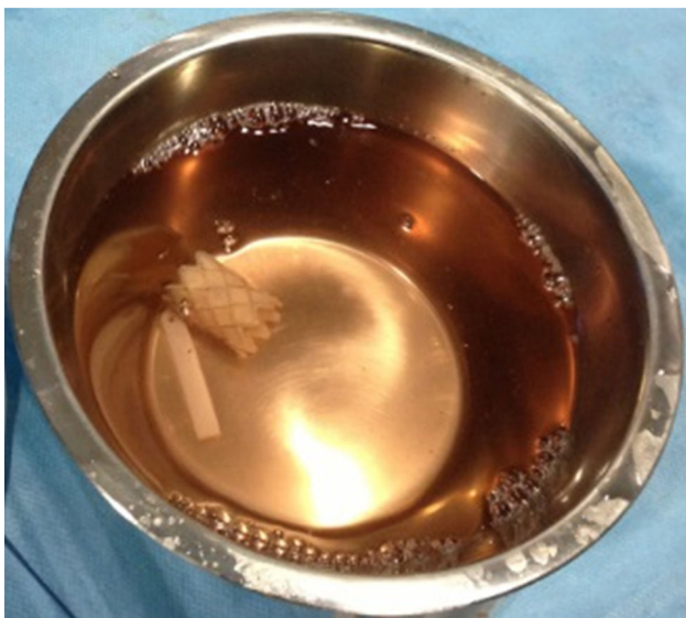
Fig. 2 – Melody ® pulmonary valve.

During tPVR, patient immobility is crucial. With the exception of arterial cannulation, it is not very painful. Some parameters should be defined to avoid oscillations in the level of sedation that can compromise the procedure. In our center, the pharmaceuticals generally used are propofol and remifentanyl in TCI, for a target BIS between 60 and 80, paying special attention to the arterial cannulation and the valve dilation and implantation. The use of capnography allows for both an early intervention based on the early detection of hypoventilation (loss of the quality of the curve or an etCO 2 > 50), thus improving the titration of the pharmaceuticals or the performance of maneuvers for opening the airways. In this way, it is possible to anticipate a desaturation that would require respiratory support and cause involuntary movement of the patient. This may include preventing excessive hypercapnia that would hinder the technique due to hypoxic pulmonary vasoconstriction. 8 Sedation, together with rSO 2 (to avoid reductions of more than 20% with respect to the patient's base values and an absolute value under 50%) 9 allows for closer neurological monitoring, given the risk of cerebral (stroke) events.