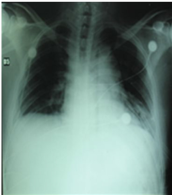
Fig. 2 – Chest X-ray at admission.