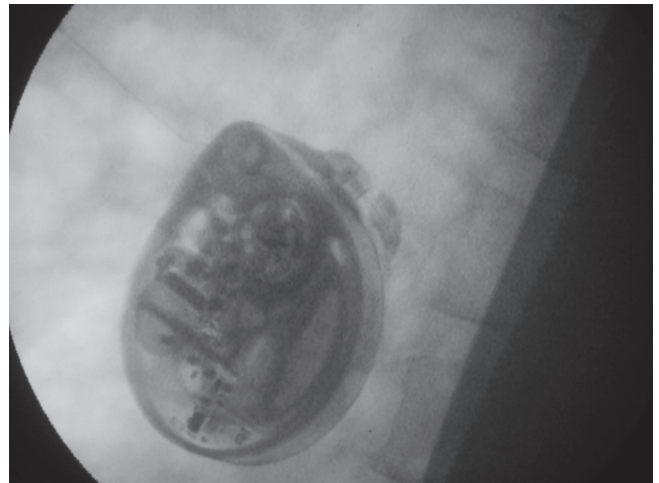
Fig. 2 – Leaking in the system at pump connection (oblique view).

a spinal puncture and the patient receive 50 µg intrathecally of baclofen as a bolus with complete resolution of his symptoms. He was taken that evening to the operating room for an exploration of his pump. Initially the abdominal site was explored, fluid was found around the pump. The system connection was change to 8709SC connector, and pump was repositioning. An increase in dose of baclofen to 550 µg/day. He quickly returned to his baseline level of function, his spasticity improved dramatically. He was discharged home on postoperative day one and on follow-up, he continued to do well.