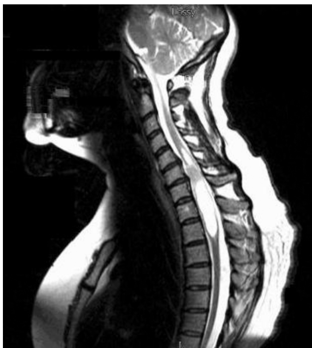
Fig. 1 – Preoperative cervical MRI.

A magnetic resonance imaging (MRI) study revealed an intramedullary tumor at C6 (ependymoma) with associated syringomyelia above and below the lesion (C5-T2) (Fig. 1). The lesion was excised through a cervical laminectomy. Persistent pain after surgery required a new MRI that showed focal enhancement in C6-C7 with spinal canal stenosis secondary to disc protrusions. The patient was taken to surgery for