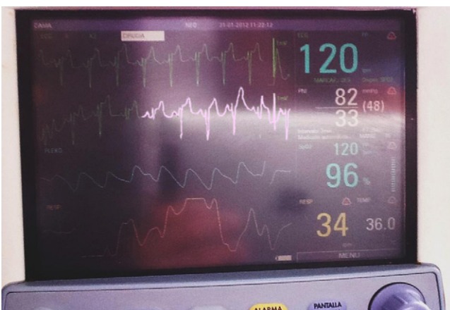
Fig. 3 – Vital signs monitoring. Normal capnometry and saturation.

Prior to 1988, when Dr. Brain introduced the laryngeal mask (LM), the only two airway management options were the facemask and tracheal intubation (the recommendation for preterm babies is the tracheal tube no. 2.5). 1 Thousands of articles and chapters published have ascertained the usefulness of the laryngeal mask as an extra-glottic device. 2 A broad range of devices modified from the original design have been introduced in the last 20 years, with a view to allow for adequate ventilation and oxygenation, easy placement and minimum risk of pulmonary aspiration.